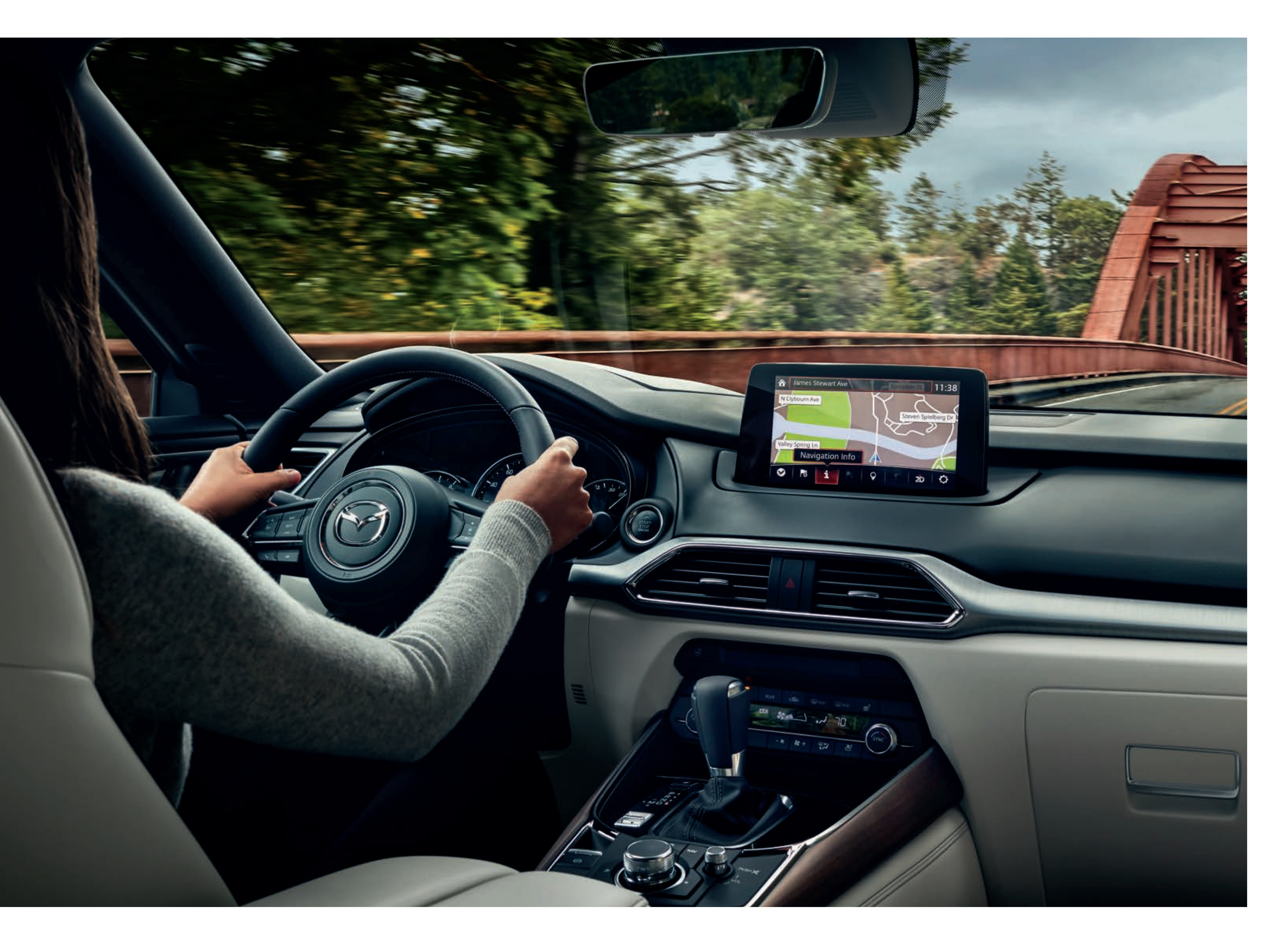
The Mazda Protection Products Vehicle Service Agreement (VSA) Gold helps protect you after your Mazda warranty expires. For more information contact your Mazda Dealer.