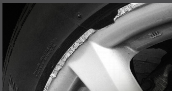
Damage to tires, rims, or hubcaps