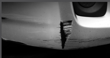
Damaged bumpers, body dents, dings, or scratches