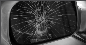
Broken or scratched windshield, windows, mirrors, or lights