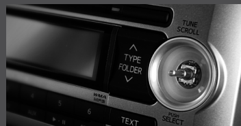
Missing parts or equipment